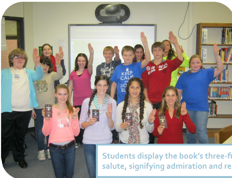
Students display the book's three-finger salute, signifying admiration and respect.

What a great way to celebrate and grow students' love of books!