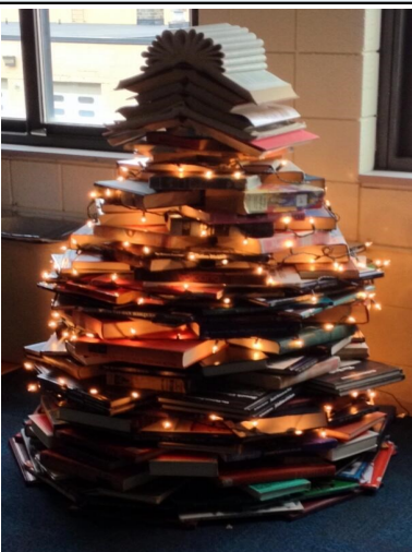
Out and About: Harpursville Jr./Sr. High School's beautiful book tree!